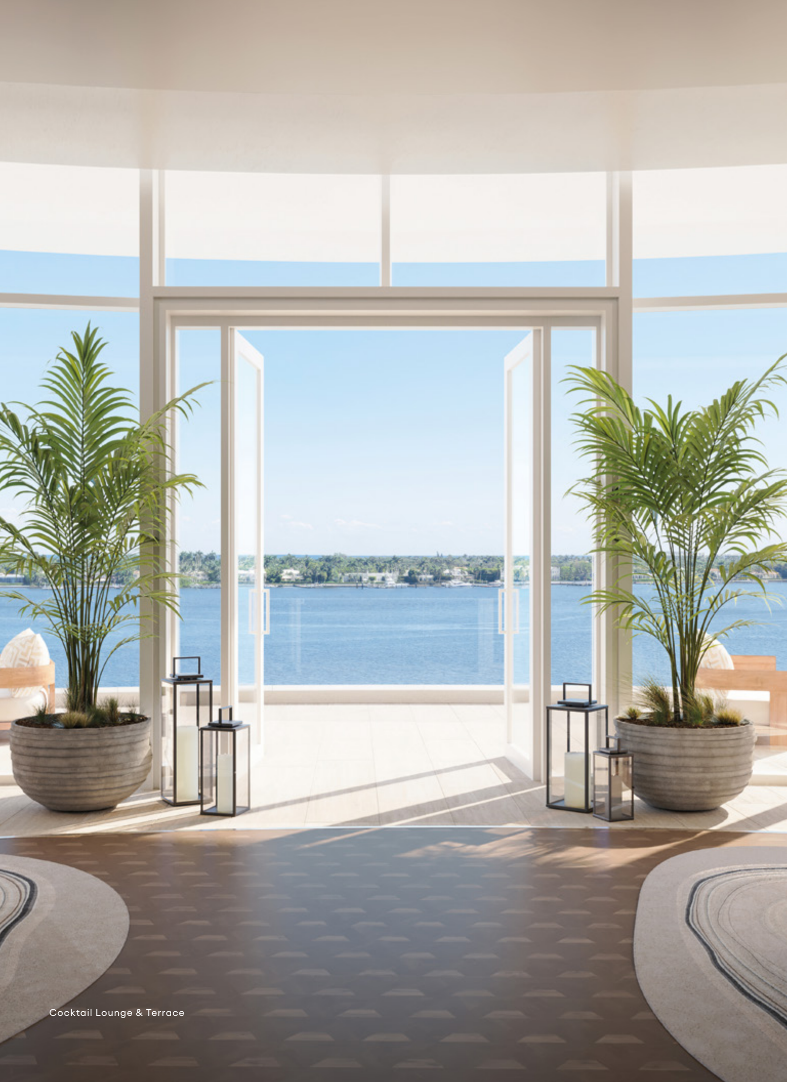
Cocktail Lounge & Terrace