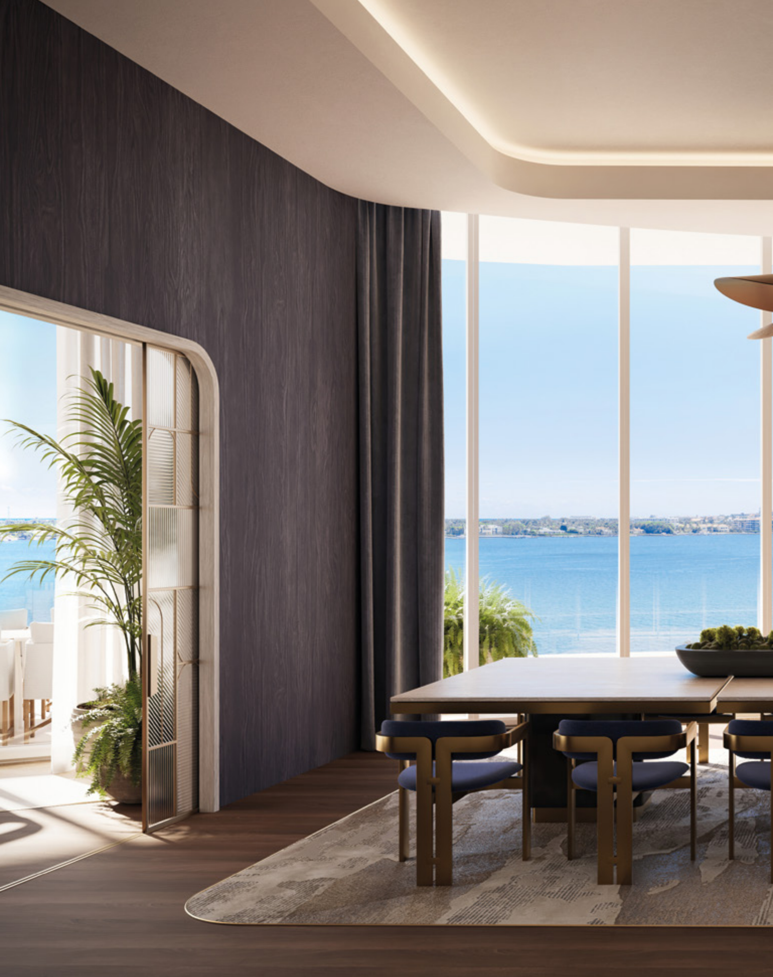
Private Dining Room