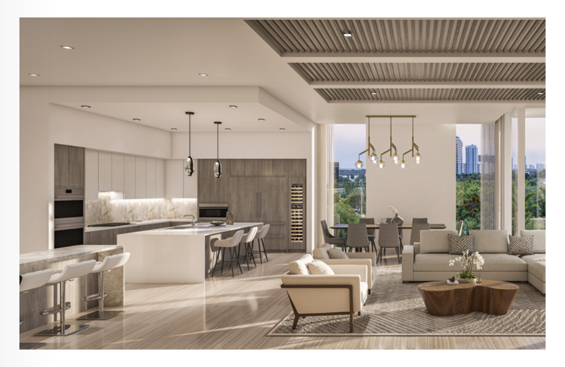
Above: Generously-proportioned kitchens and great rooms feature wet bars with quartz countertops. Below: Private entry foyer, open-concept kitchen with adjoining wet bar and grand master suite.

Private elevators with controlled access ensure the utmost in discretion. A full suite of professional-grade Wolf® and Sub-Zero® kitchen appliances bear witness to memorable social gatherings. Floor-to-ceiling, triple-panel, impact-resistant glass doors and windows preserve an environment of quiet, sumptuous comfort. Outfitted with double walk-in closets, free-standing soaking tubs, glass-enclosed showers and European doublevanities, grand owner's suites are private sanctuaries of refinement and relaxation. Set to raise expectations for well-appointed, waterfront living, here, ocean-inspired elegance reigns supreme.