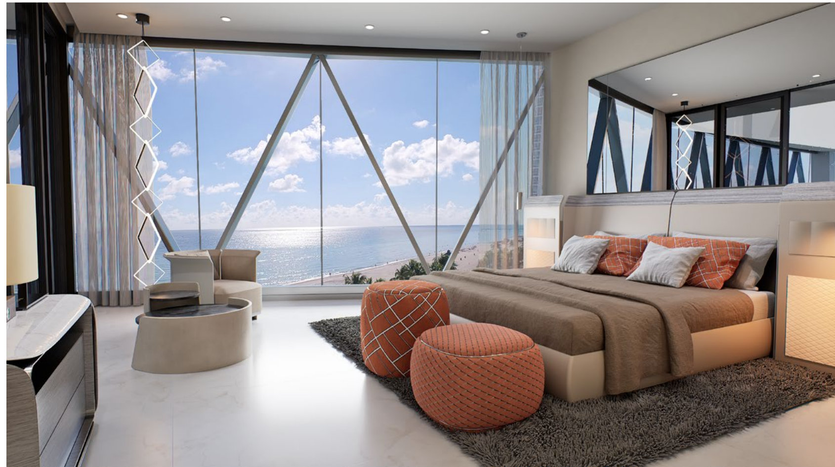
Residence Azure Master Bedroom