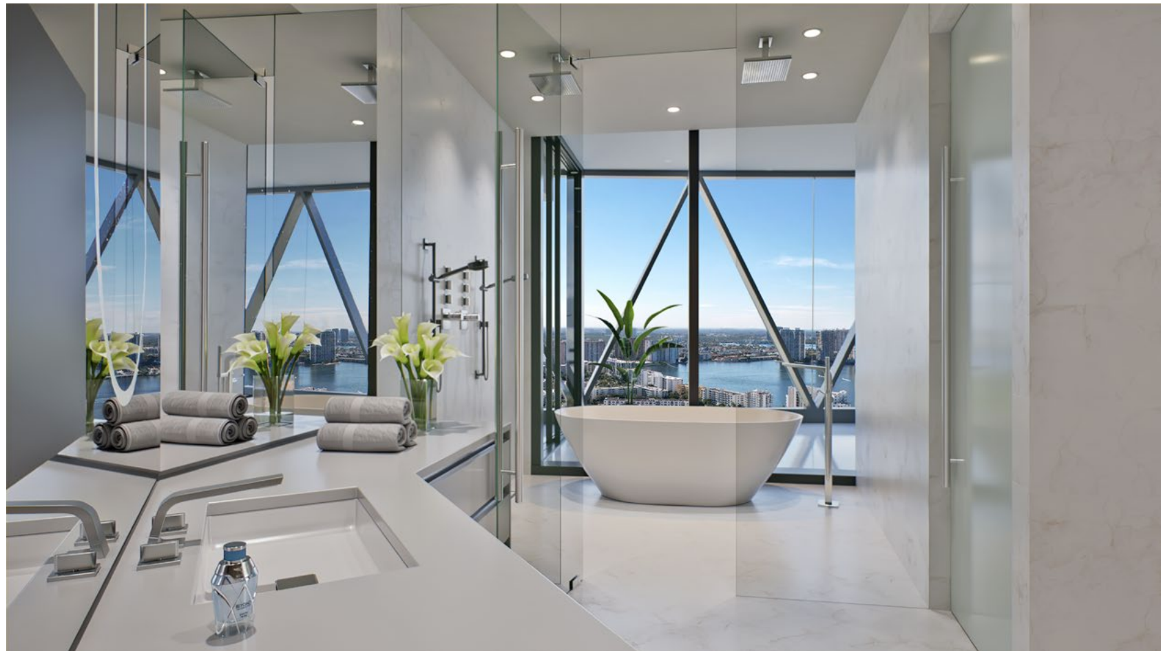
Residence Bentayga Master Bath