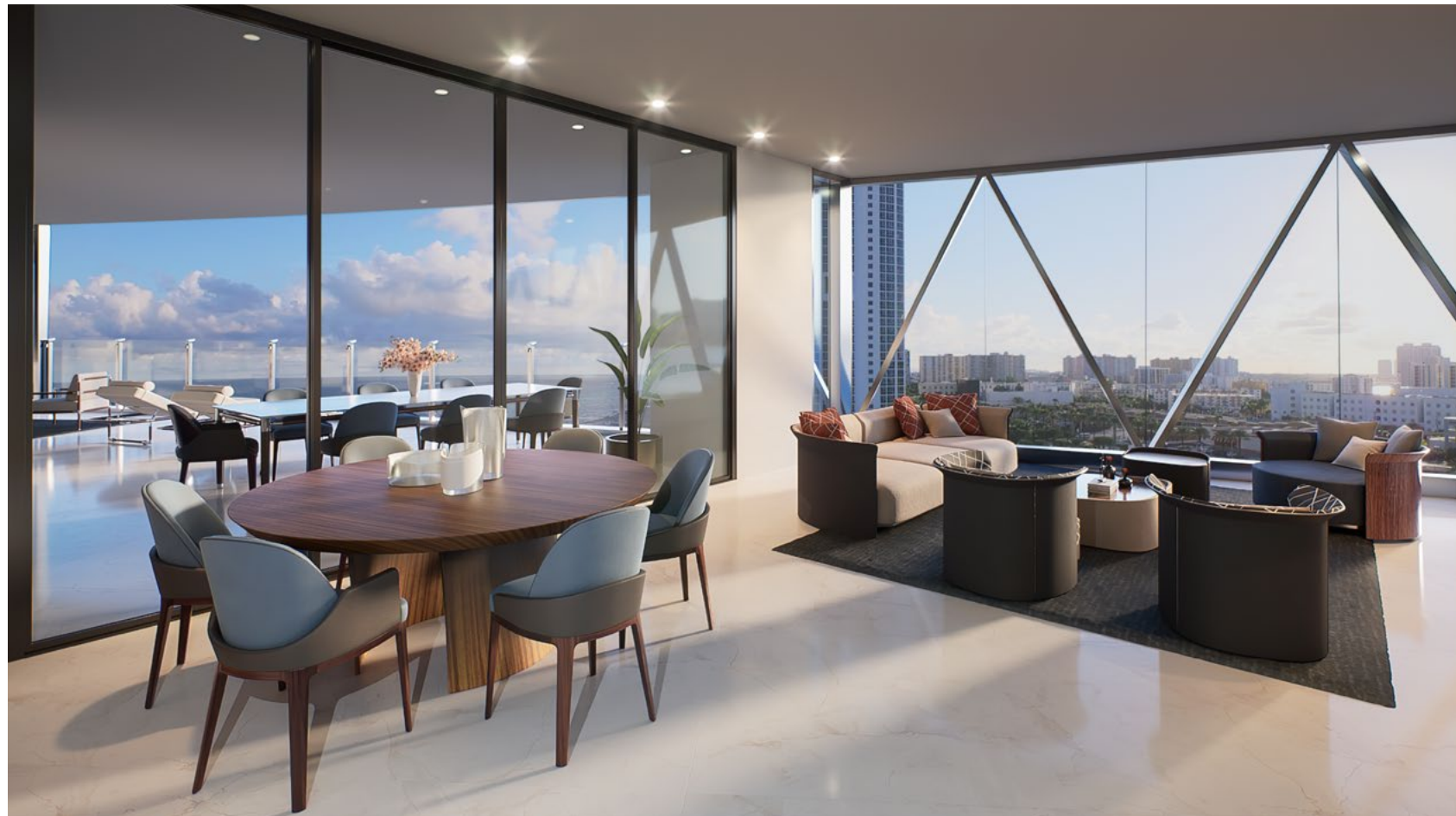
Residence Bentayga Great Room