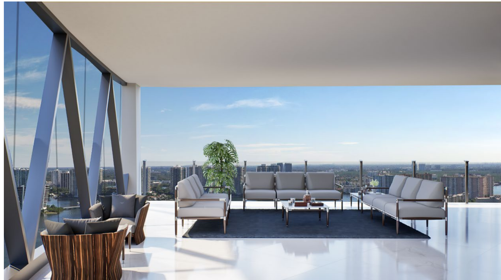
Residence Bentayga Sunset Terrace