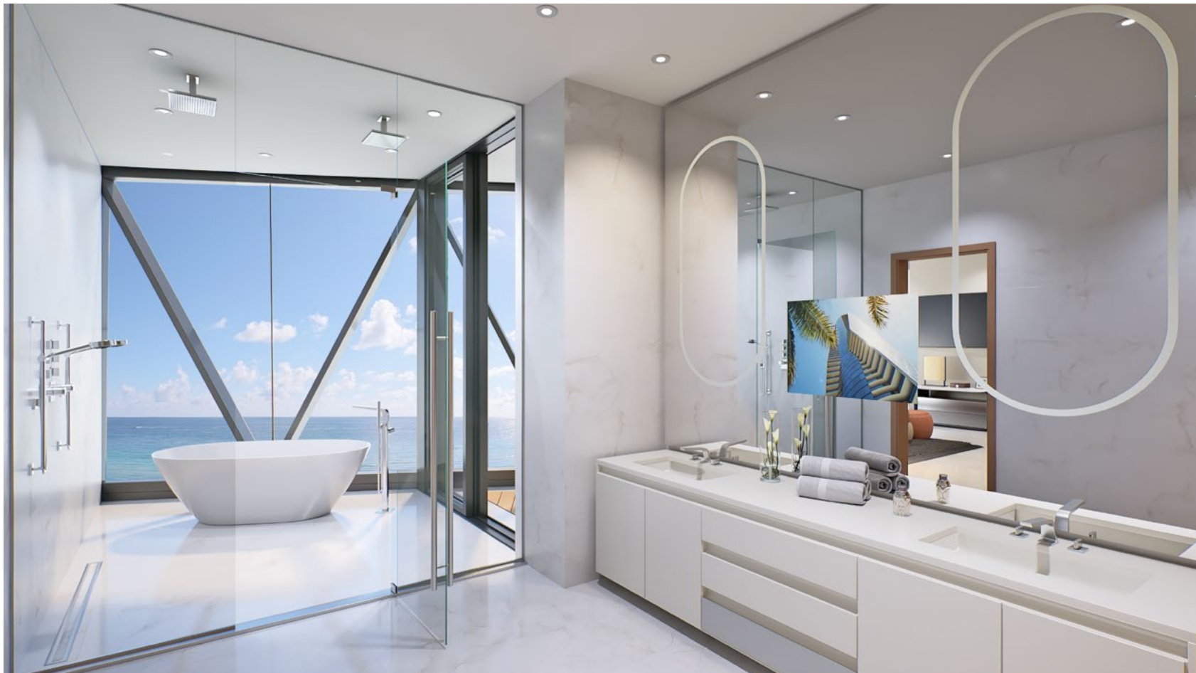
Residence Azure Master Bath