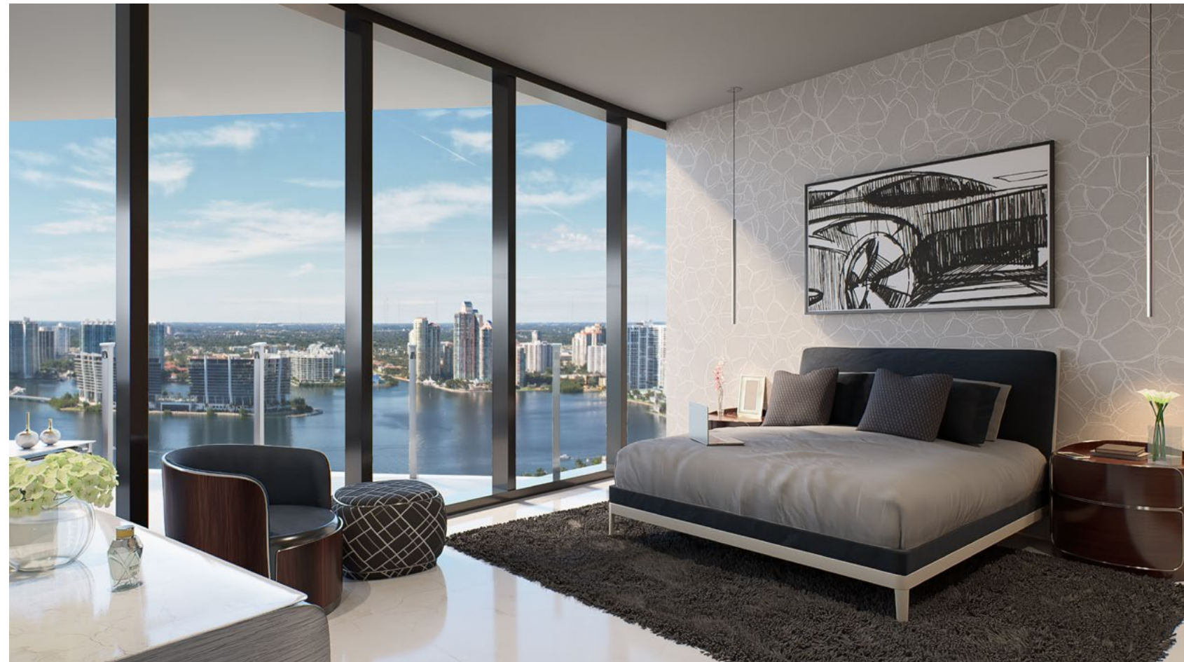
Residence Bentayga Master Bedroom