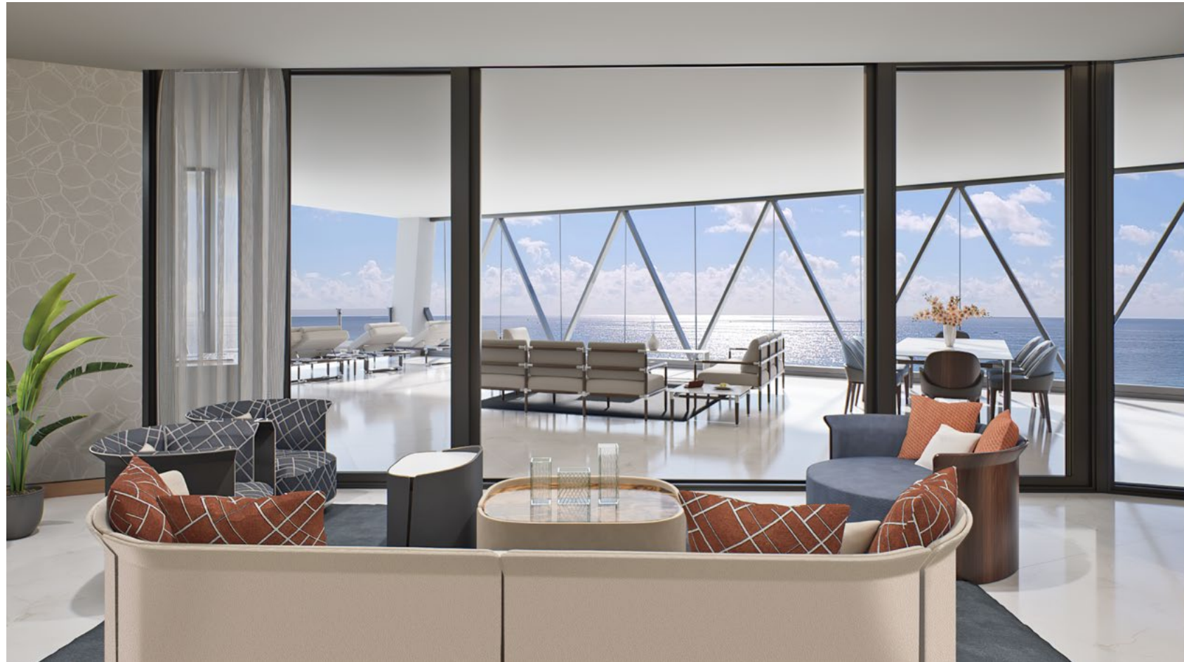
Residence Azure Great Room & Florida Room