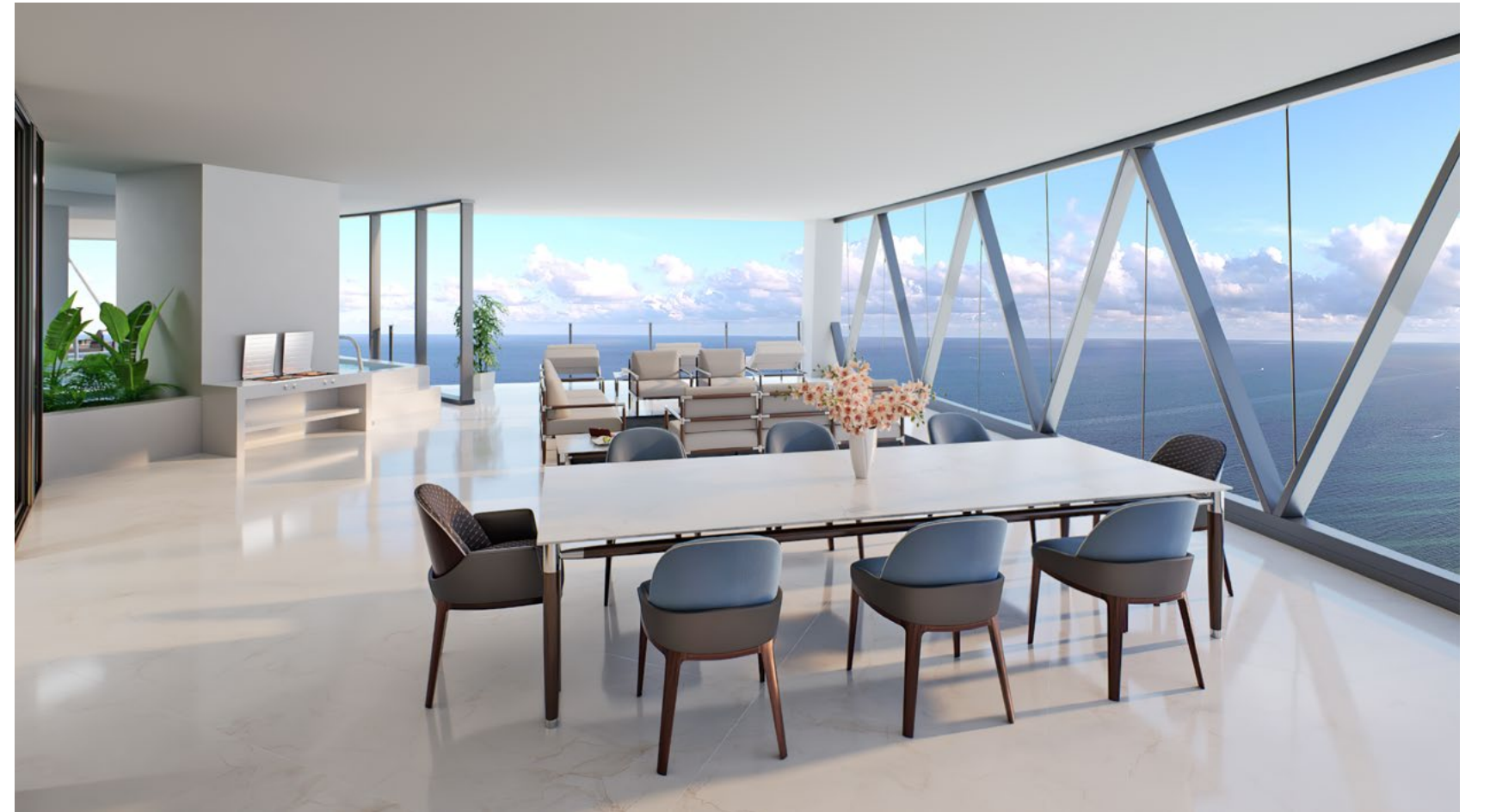
Residence Azure Florida Room