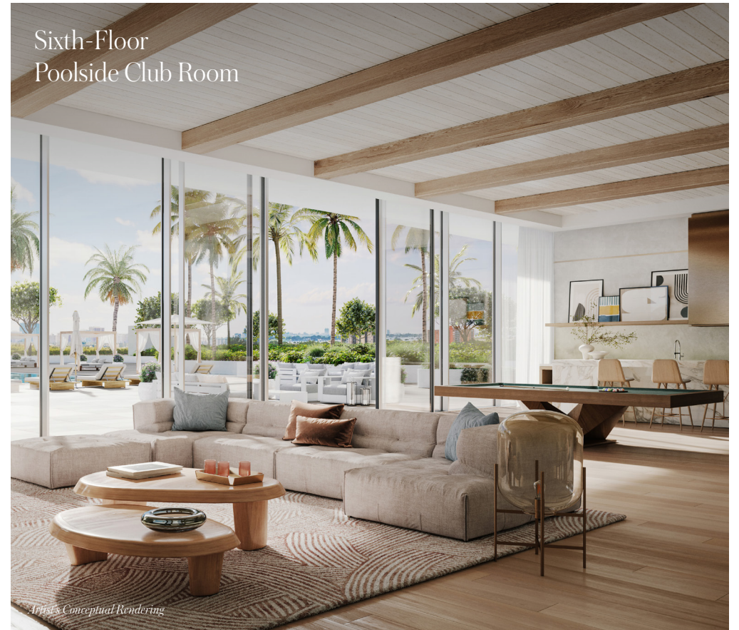
Sixth-Floor Poolside Club Room